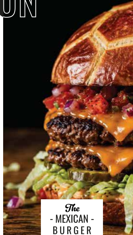
The - MEXICAN - BURGER

Jumbo hot dog, caremalised onions served in a pretzel sub