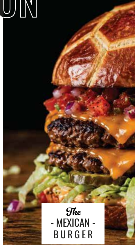
The - MEXICAN - BURGER

Our meat is sourced locally, with burgers, beef and gammon supplied by Goosemor. We also use local, free-range eggs to ensure quality and freshness in every dish.